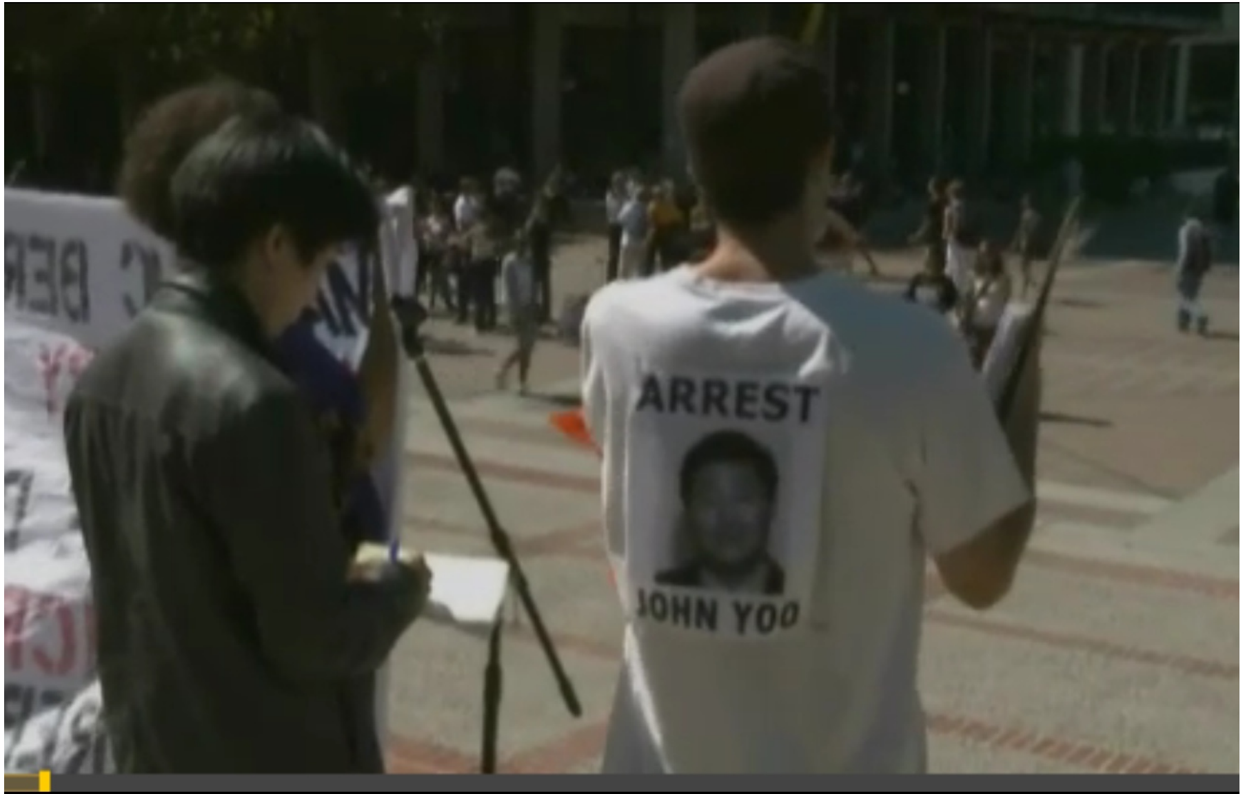
Scene from PBS Newshour with Jim Lehrer, aired 20 Oct 2009.