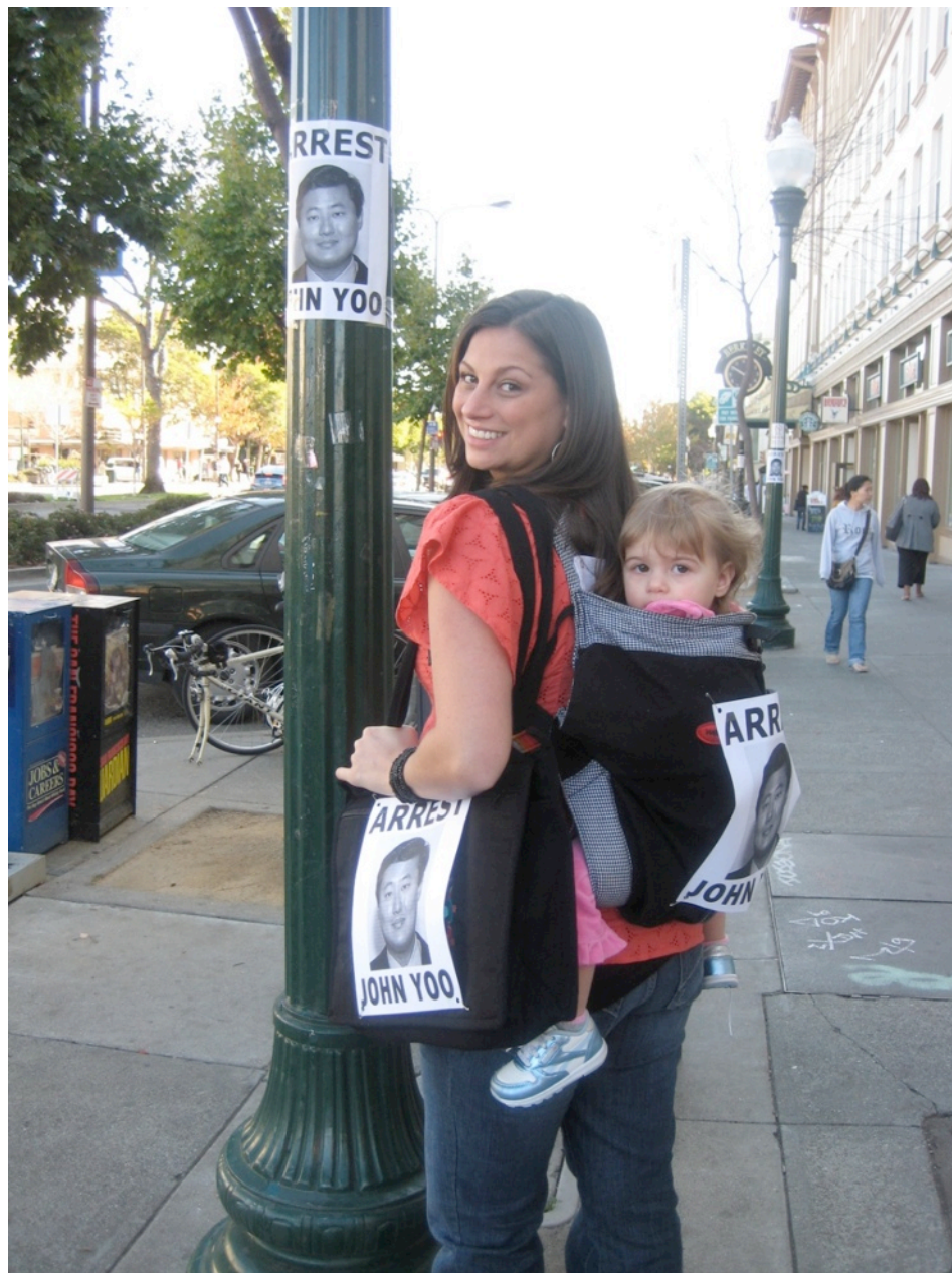
Shattuck Ave, Berkeley, CA