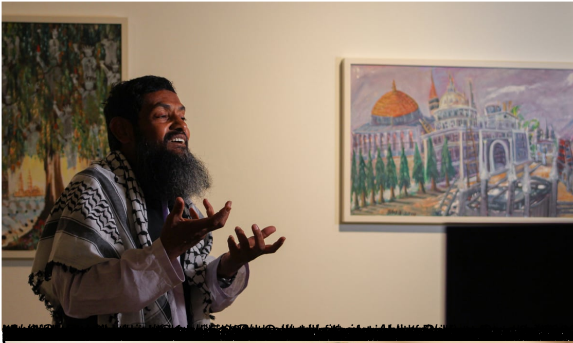
Malik Isfahan galleries