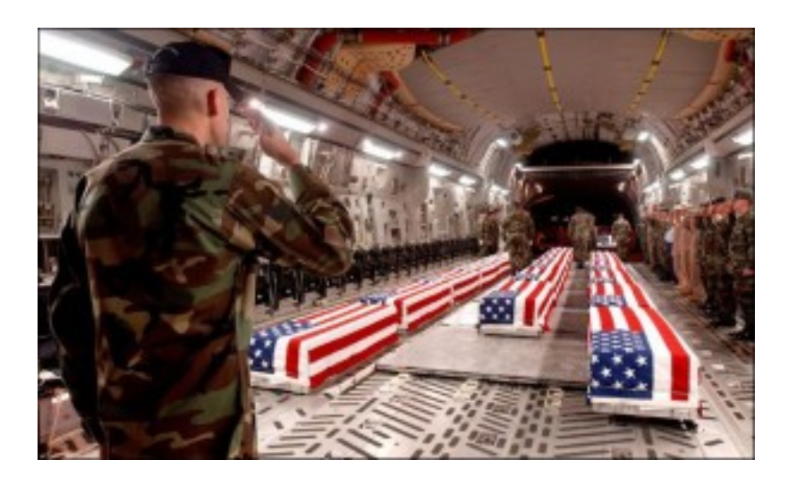
Coffins of dead U.S. soldiers arriving at Dover Air Force Base in Delaware in 2006.

Last Sunday's Oscar Awards were interrupted by an <u>incongruous propaganda exercise</u> featuring a Native American actor and Vietnam vet, featuring a montage of clips from Hollywood war movies.